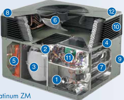
Platinum ZM Gas/Electric System